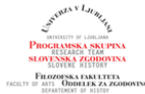
Research team Slovene History