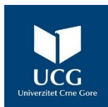
University of Montenegro, Historical Institute