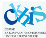
Centre for Comparative Historical and Intercultural Studies, Zagreb