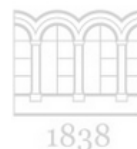
University of Belgrade, Faculty of Philosophy, Department of History