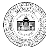
University of Sarajevo, Faculty of Philosophy, Department of History