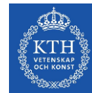
KTH Royal Institute of Technology, Environmental Humanities Laboratory, SE